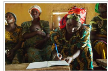
Congolese women attend an Oxfam-led committee meeting on sexual and gender based violence Bweru, DRC.

This article as part of the openDemocracy blog series on Evaluation and Human Rights highlights Oxfam’s protection programme in the Democratic Republic of the Congo (DRC), its engagement of Community Protection Committees to identify and address threats and measure milestones of change. This underscores the criticality of starting with the affected population in order to inform a robust, context-specific